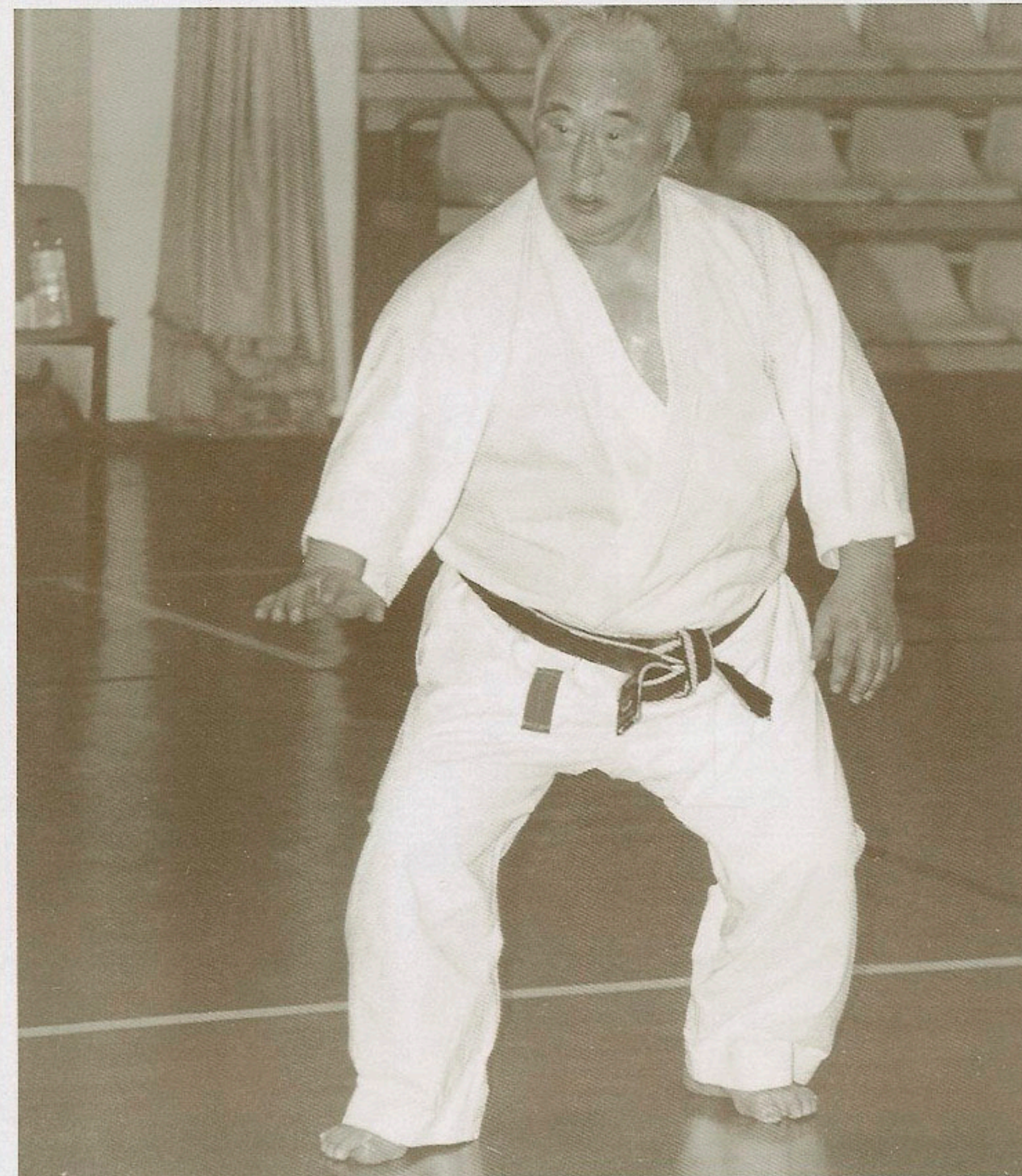
"One of the most important parts of Budo arts practice is the repeated technique or combination."

T.K: Toate means to touch without touching. An example of how to begin controlling this capacity is: when we block the attacker vigorously, with a lot of energy, at the beginning of the attack, and continue doing so repeatedly many times, with a lot of concentration and the correct breathing, and then one of the times we do not block him, he feels as if we had and does not attack, he is doubtful. This would be an example of the initiation of Toate, but there is a lot more and only a few like sensei Egami and Yoshitaka have